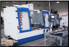
In-house tooling allows for faster turnaround time and increased reliability.

Alco Plastics is a supplier of custom injection molded products and services determined to satisfy our customers' requirements through a commitment of continual improvement in our methods